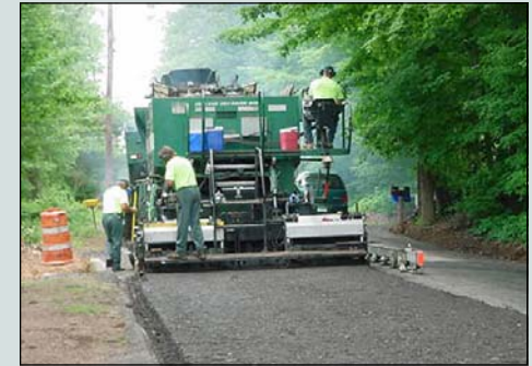
A Road Scholar Elective Workshop

September 29, 2009 Manchester, CT (larger towns) ----- September 30, 2009 Glastonbury, CT (smaller towns)