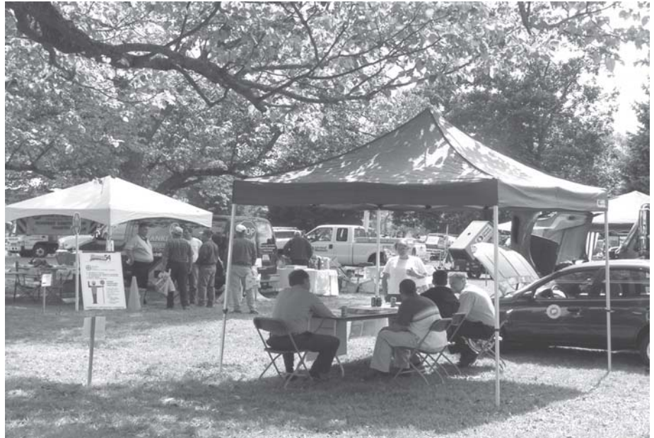
At the Technology Transfer EXPO, visitors had the chance to meet with more than 60 exhibitors to learn about new resources available to public works agencies.

Our commitments as a proud co-sponsor of next year's Eastern Winter Maintenance Symposium in Hartford will preclude us from presenting the Technology Transfer EXPO in 2005. However, the EXPO will return in 2006, and we hope you'll join us then.