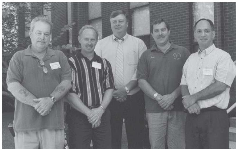
Connecticut Road Scholar Graduates of 2004

For more information on the Connecticut Road Master Program, the Connecticut Road Scholar Program, the Connecticut Municipal Legal Traffic Authority Program, or any of the other training programs and services available from the Connecticut Transportation Institute's Technology Transfer Center, please visit our web site at www.cti.uconn.edu or call 860-486-5400.