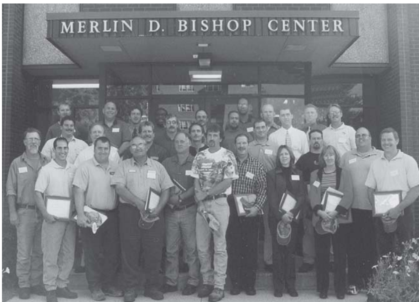
Connecticut Road Master Graduates of 2004