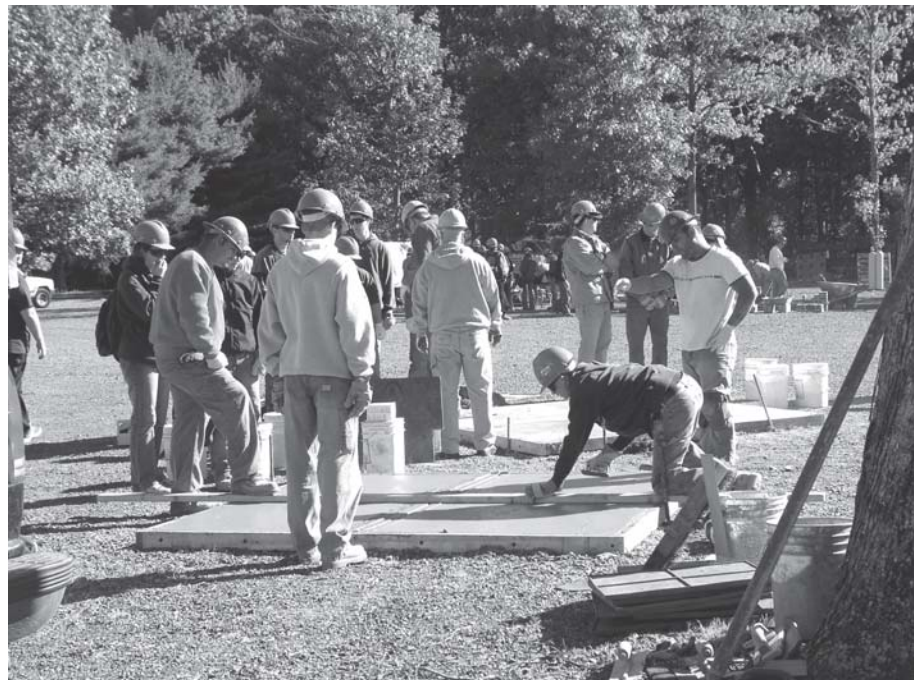
Finishing concrete was one of the many hands-on activities the students could try.

Barbara Turner from the Virginia Center was equally enthusiastic, "As I watched the students interact with the exhibitors at the outdoor exhibit areas, it brought a special appreciation for the construction professionals taking time out of their busy schedules to show students that there are