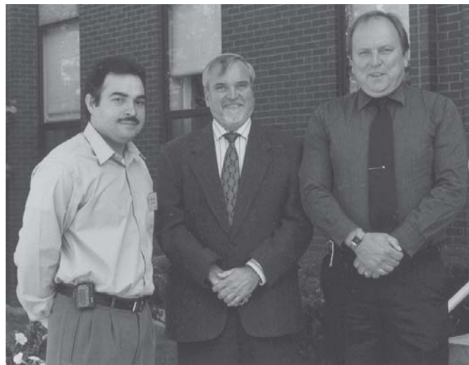
Connecticut Municipal Legal Traffic Authority Graduates of 2004